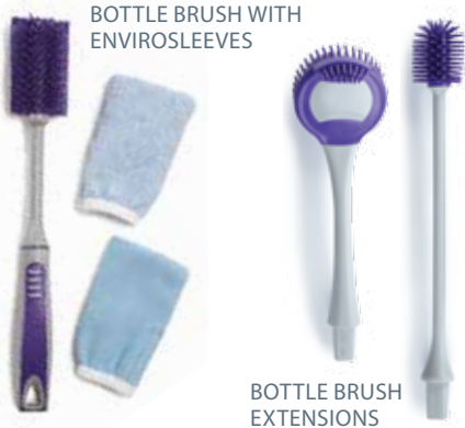
BOTTLE BRUSH WITH ENVIROSLEEVES

SOLUTION : The Bottle Brush and EnviroSleeves are perfect for cleaning a variety of jars, bottles and vases. The Brush's ThermoPlastic Rubber bristles are flexible, yet sturdy, and won't harbor bacteria. The EnviroSleeves slip on easily to scrub away, lift and remove even stuck-on residue. And our new Bottle Brush Extensions are great for cleaning hard-to-reach areas.